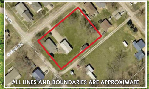
ALL LINES AND BOUNDARIES ARE APPROXIMATE